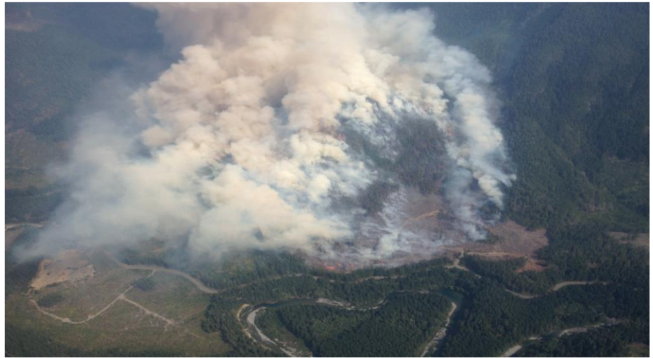
Spring Rd/Lizard Lake fire – Afternoon of August 12

1-800 663-5555 or dial *5555 on your cell